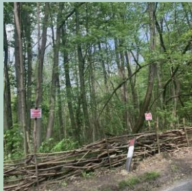
Fowler Stone Wood